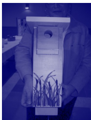
One of the many raffle item at this years banquet.